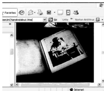
Fig. 3 Digital image from Un Chien Andalou (1929) in browser window