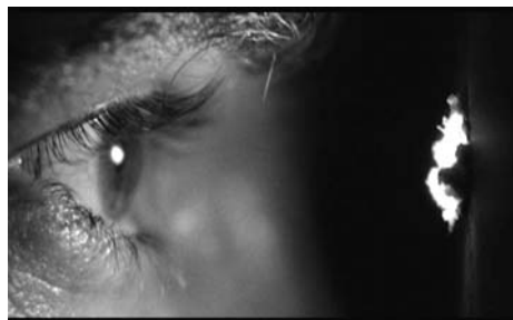
Fig. 2 Still from Hitchcock's Psycho